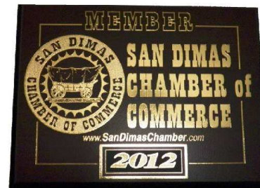
Newly Designed Membership Plaque For All Members

It's going to be an exciting year for members of the San Dimas Chamber of Commerce. The first of several exciting new benefits is the Free Membership Marketing Software - Members can now update their membership profile, enhance their website presence, post hot deals, offer member to member deals, list job postings, and add to the community calendar on the chamber's website. The second is a newly redesigned Membership Plaque for all members, which should be displayed prominently in your business for customers to see. This shows that you are a vital member of the community, you contribute to the economic health of the area and you support business. Several new events were created including a business conference get-a-way cruise to Alaska and Lunch & Learn business networking luncheons to give members and others the opportunity to build relationships.