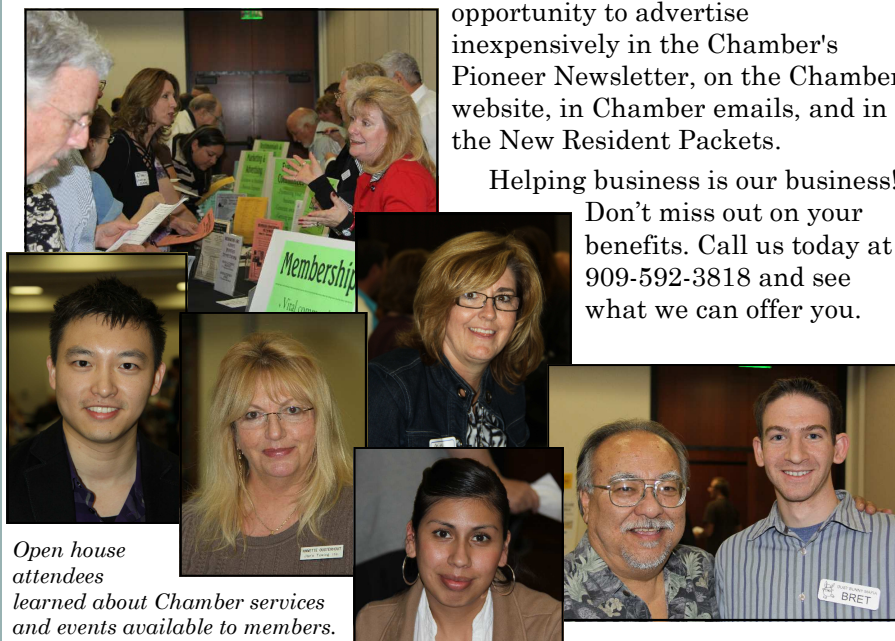
Open house attendees learned about Chamber services and events available to members.

Don't miss out on your benefits. Call us today at 909-592-3818 and see what we can offer you.